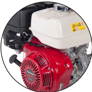
Honda GX340 Engine

A world leading Interpump direct drive pump powered by an ultra reliable Honda petrol engine ensures the Cobra has a long & trouble free life.