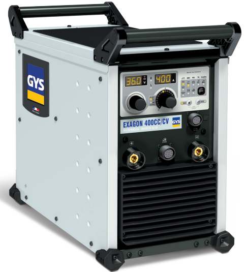
Supplied without accessories