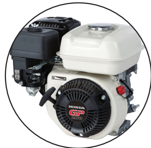
Honda GP160 Engine

A world leading Interpump direct drive pump powered by a Honda GP petrol engine ensures the GP Series has a long & trouble free life.